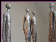
Sculpture by Bettina Seitz