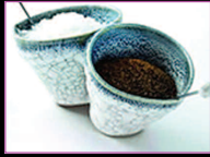
Ceramics by Lynda Gault