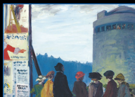
Communicating with Prisoners, Jack B. Yeats