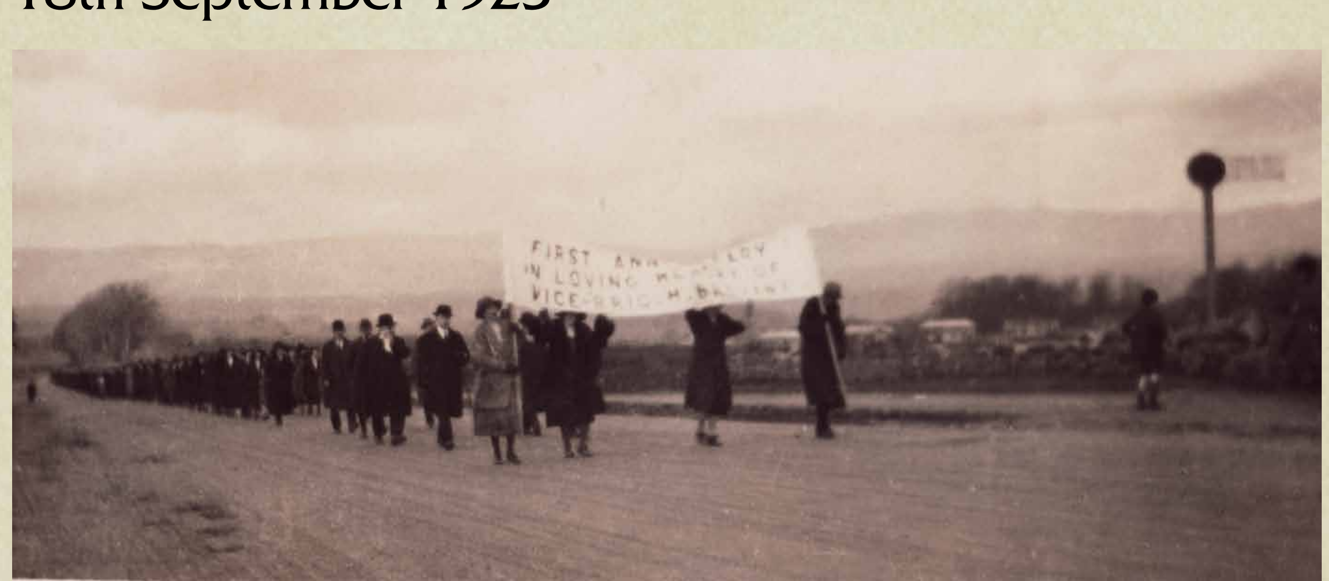
A major parade to commemorate Sligo's Noble Six