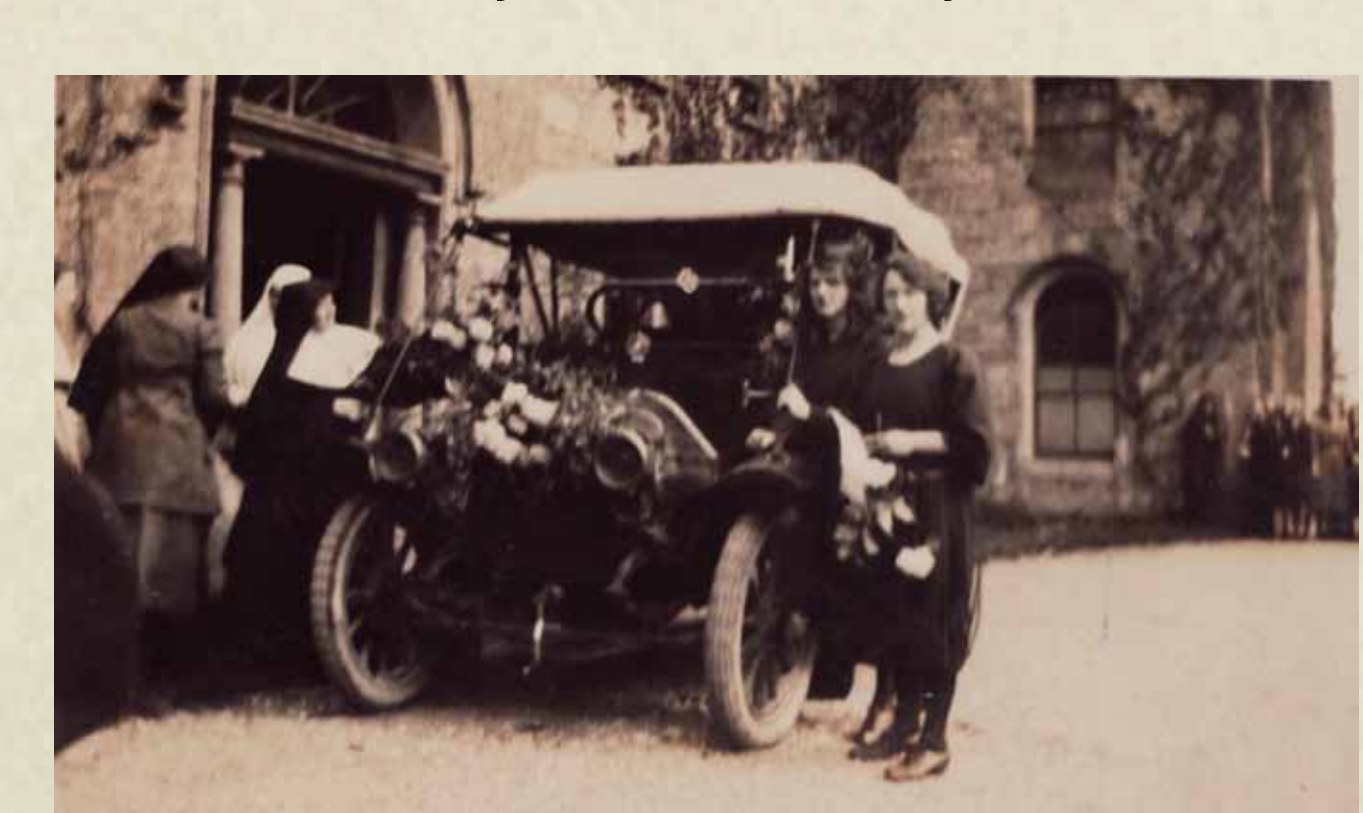
Nuns placing flowers on DeValera's car

DeValera at front door of Ursuline Convent