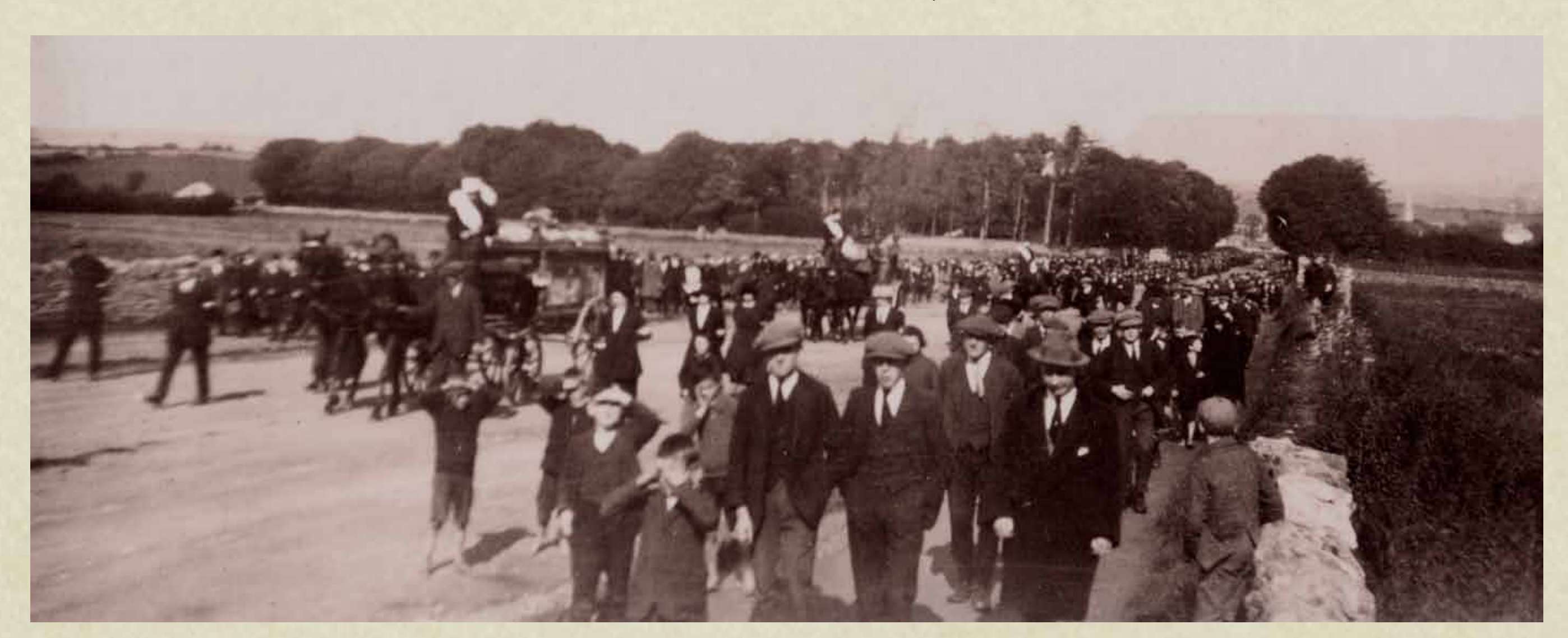
The Cortège reaching the top of Pearse Road (The Line), just turning for Sligo Cemetery. Please note that there are no houses on either side of the Line.