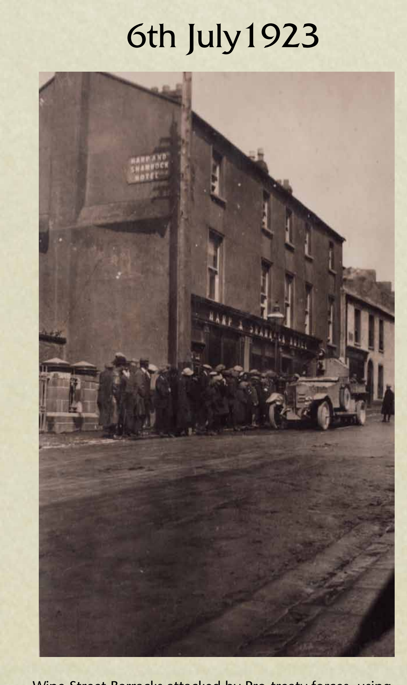
Wine Street Barracks attacked by Pro-treaty forces, using The Ballinalee Armoured Car to clear the barracks of Anti-treaty forces. The Ballinalee can be seen outside the Harp and Shamrock Hotel at the strategic junction of Stephens St., The Mall and Bridge St.