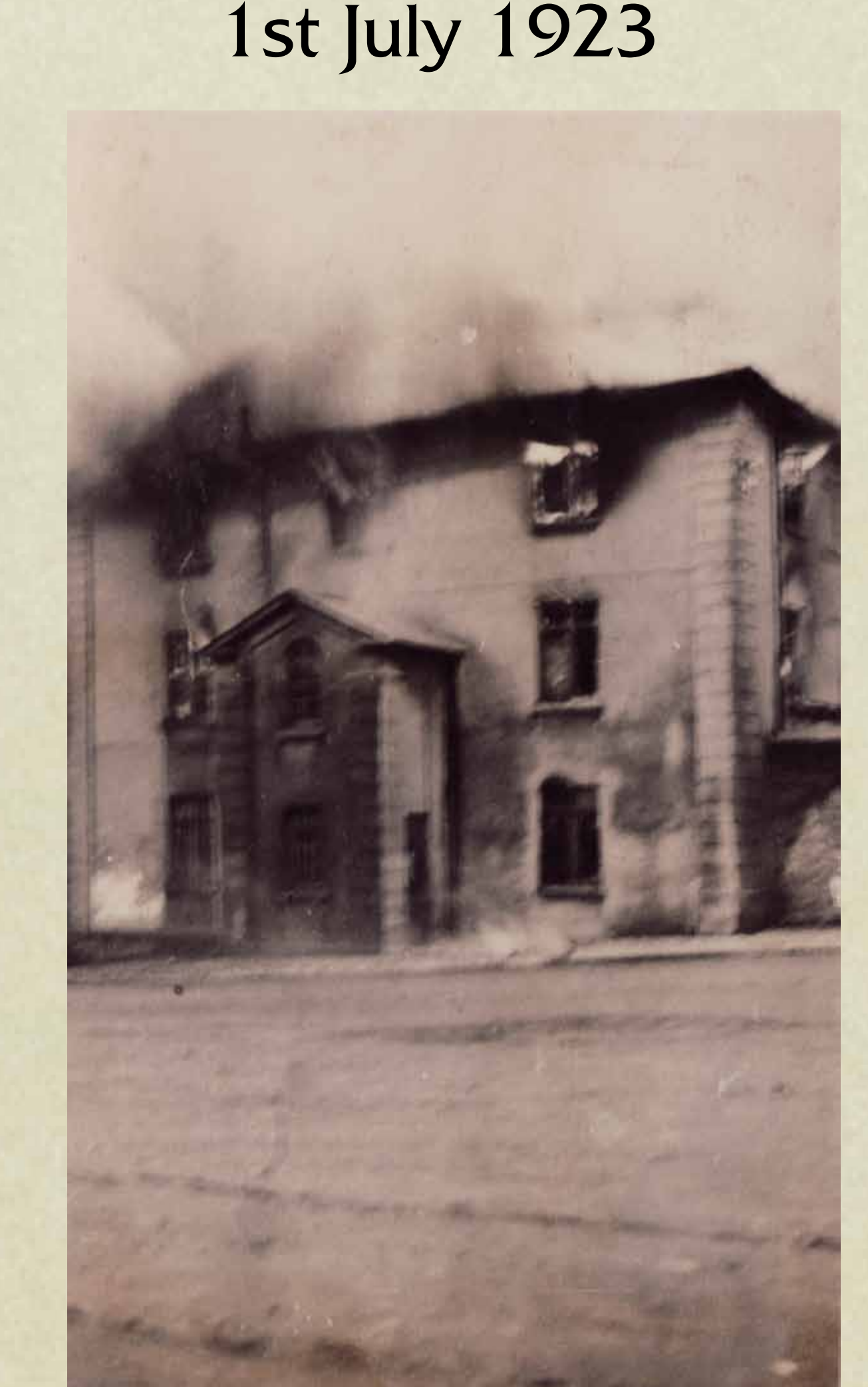
The No. 1 Police Barracks burned by Anti-treaty forces before evacuation.