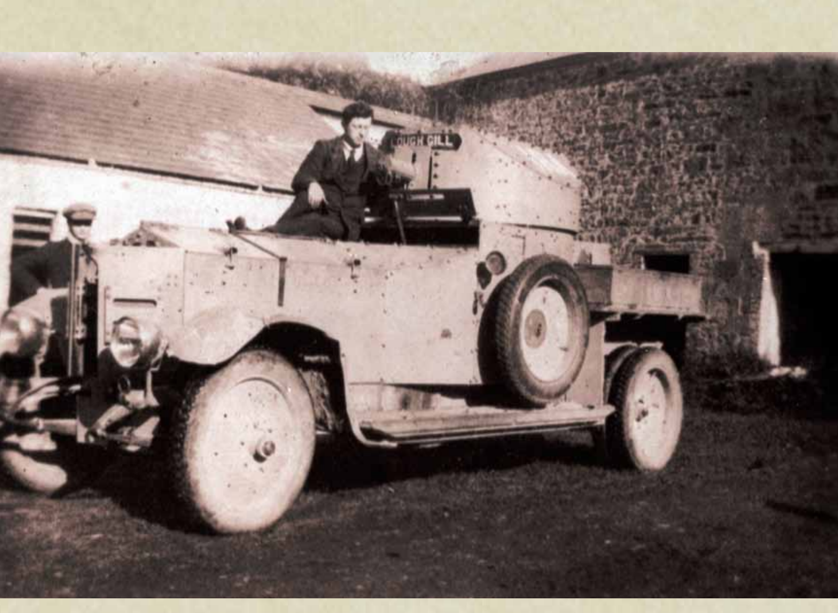
The Ballinalee Armoured Car