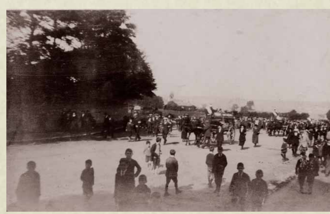
The funeral progressing up to the cemetery at the junction of Pearse and Mail Coach Roads