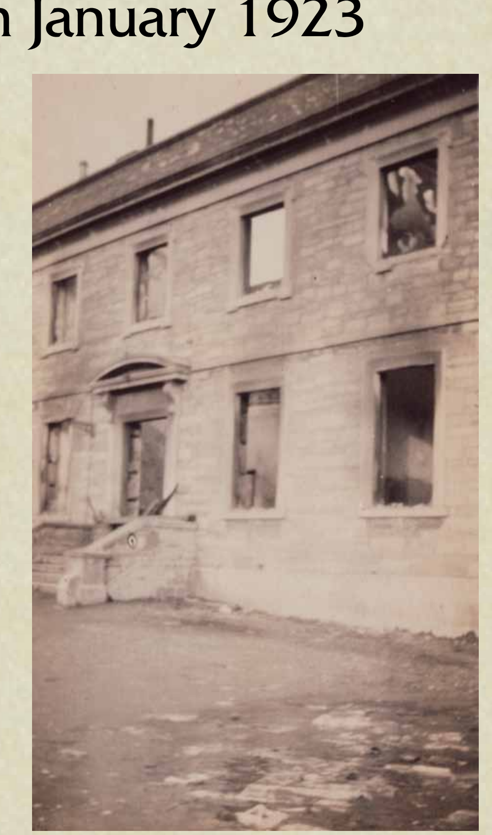
11th January 1923