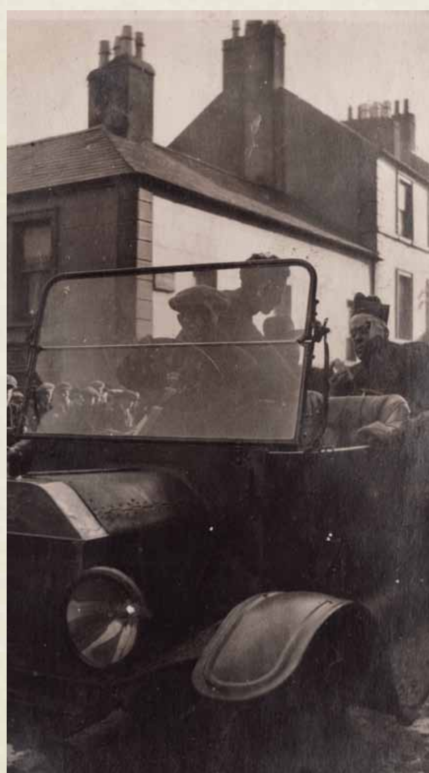
Bishop Coyne reading terms offered by the Anti-treaty side to Pro-treaty side.

On the 18th of September 1922 a major offensive by General Mc Keon of the Pro-treaty forces lead to a serious fight on Benbulben. Six Anti-treaty fighters were killed, Devins, Benson, McNeill, Langan, Banks and Carroll to be later called "Sligo's Noble Six".