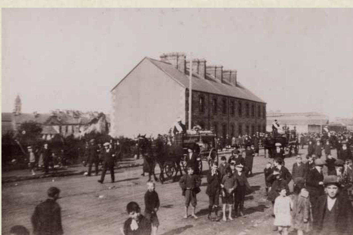
Funeral of Devins, Carroll and Banks on Lower Pearse Road